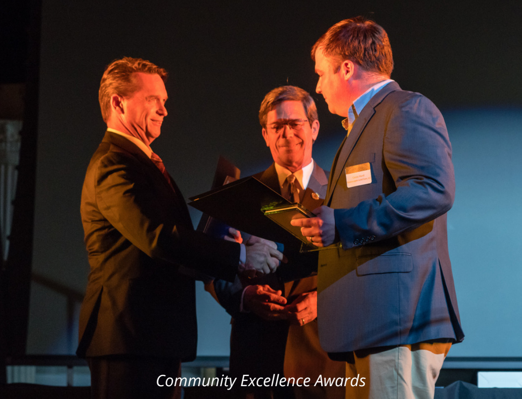
Community Excellence Awards